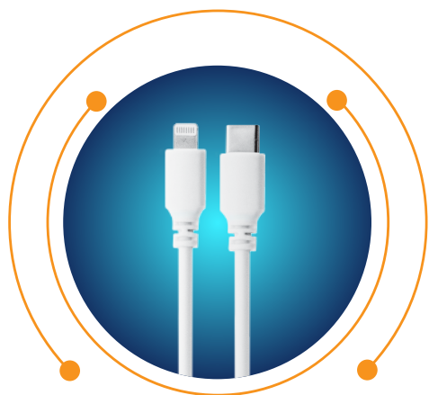
TYPE C to LIGHTNING