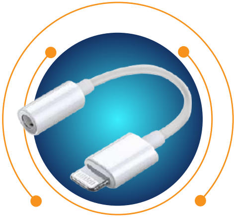
Female AUX to LIGHTNING