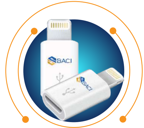
Lightning to Micro