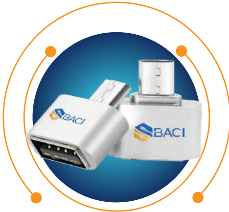
Micro B to Male A