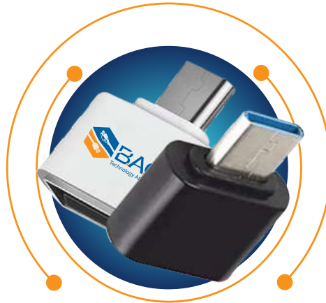
Type C to Male A